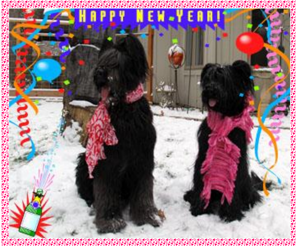
Peggi & Chuck Novak "Rae & Scarlet"